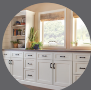
Kitchen & Bath

For a complete line of Wolf products, including these items and more, please visit our website.