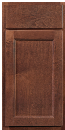
Harvest Brown Stain